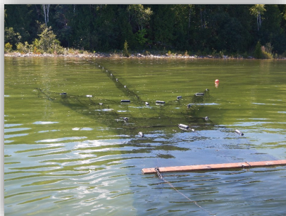
Trap nets used in Sheshegwaning First Nation for a Project in 2014

The purpose of this study is to provide information about the declining walleye populations in Lake Wahnapiatae, and will be used to assist Wahnapiatae First Nation in developing a strategic plan to monitor the walleye population in their traditional territory.